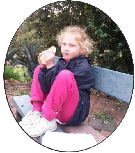
Hot dogs for breakfast

Thanks Sharron for arranging this event. It was, however just heart breaking to see the amount of litter people left behind.