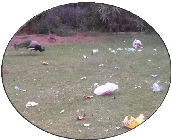
Birds amongst all the litter