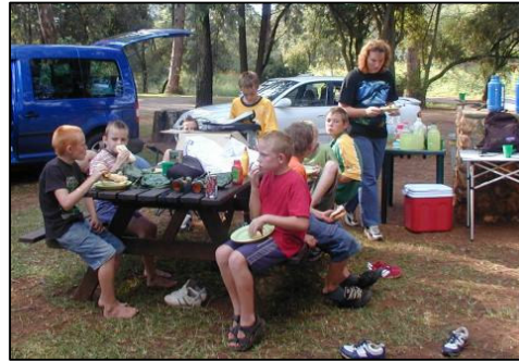
Children from Jacaranda Children's home having hot dogs in Groenkloof Nature Reserve