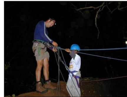
Children from various children's homes abseiling during a night hike in Irene