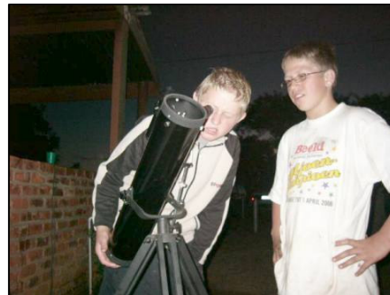
Stargazing at Roodeplaat Nature Reserve