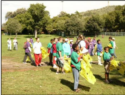
Children from Bramley children's home having fun during the hike at Fonteinedal.

During the 18 events that were held during the financial year, 822 people were exposed to nature and 261 bags of litter were picked up.