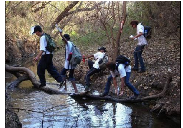
2006-06-10. Orienteering at Pelindaba