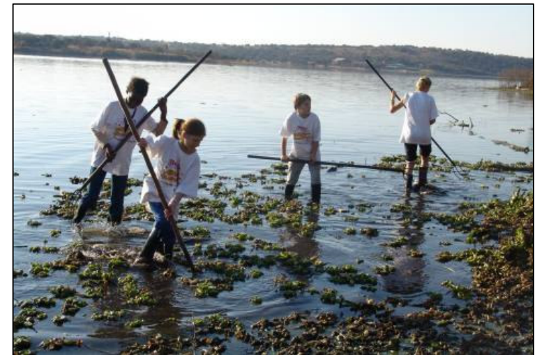
Bush Babe Camp - Cleaning the Roodeplaat Dam