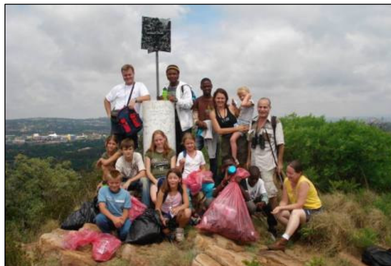
2006-10-28. On top of Faerie Glen Nature Reserve