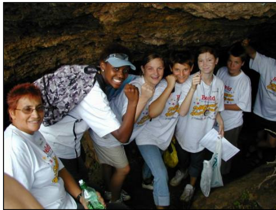
The All Girl team in the cave at Groenkloof Nature Reserve